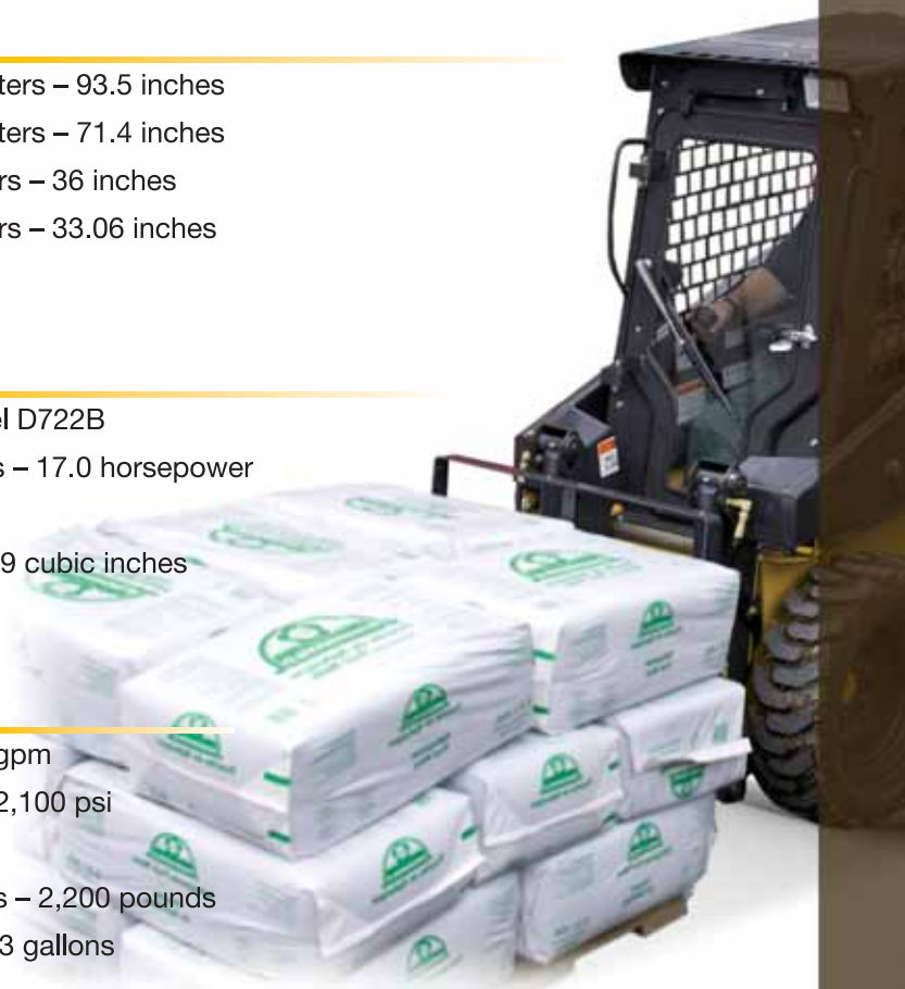
Lift Capacity, lbs