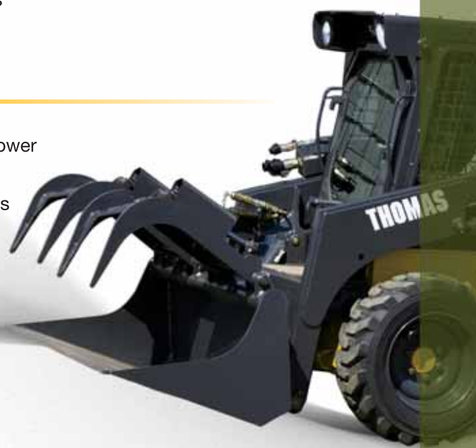
Lift Capacity, lbs