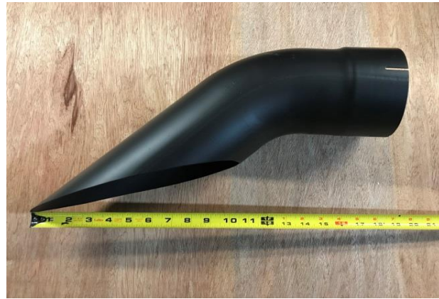
19" LONG X 6" ROUND (ID)